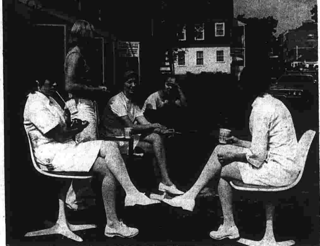
Staff members from doctors' offices damaged in last night's fire await instructions on where to begin cleaning up. The lower left window on the side of the building (below) is the one police say someone pushed an air conditioner through in order to gain entry to the building.