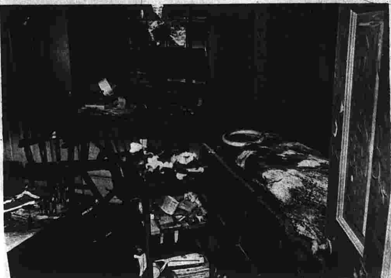
Heavy damage resulted in the room police say was broken into before last night's blaze.