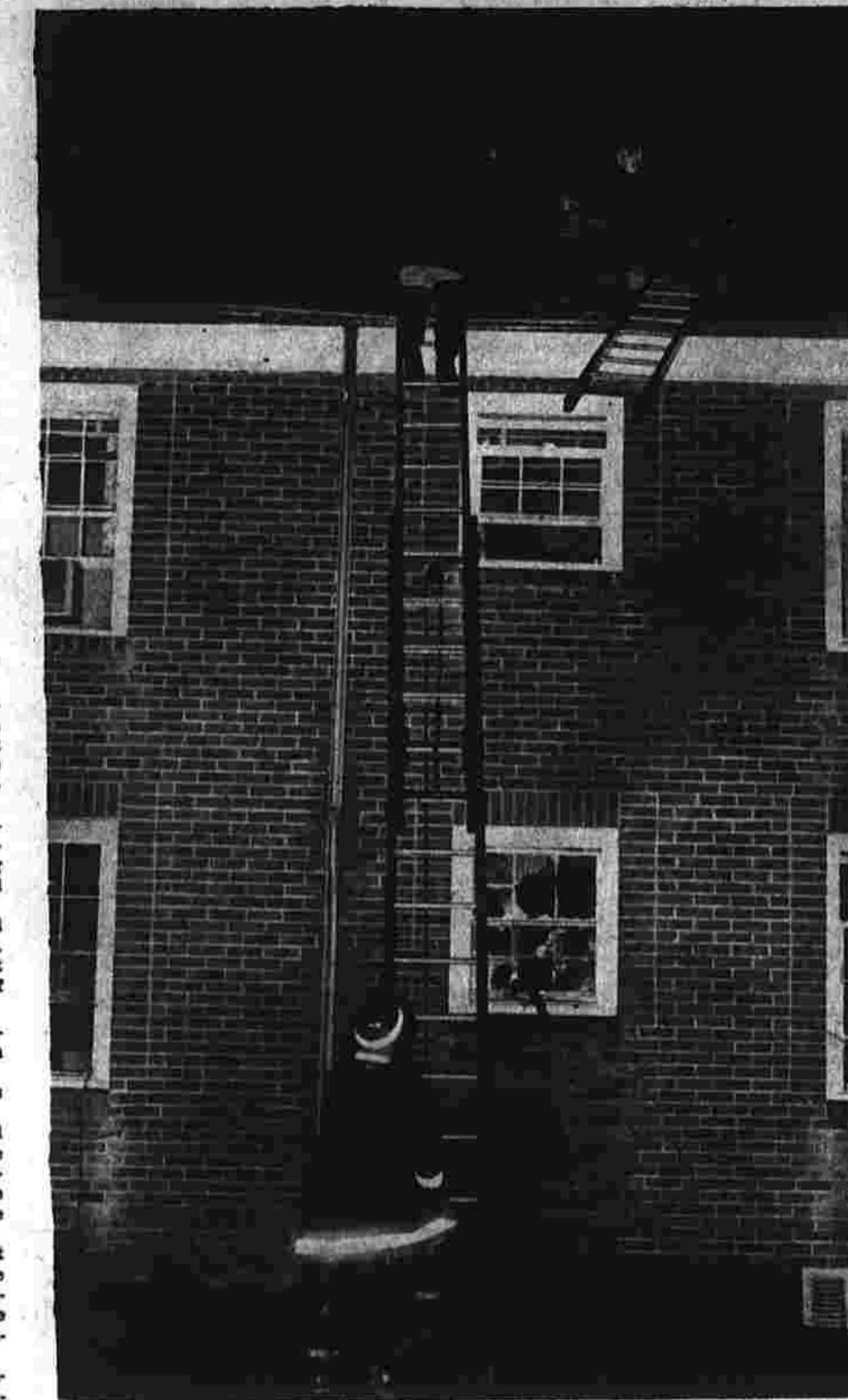
Firemen battle blaze at medical offices on Haynes St.

Humphrey Blames Self for Downfall. Washington (AP)—Sen. Hubert H. Humphrey says his own mistakes and a flawed selection process have helped Sen. George McGovern become the front-runner for the Democratic presidential nomination.