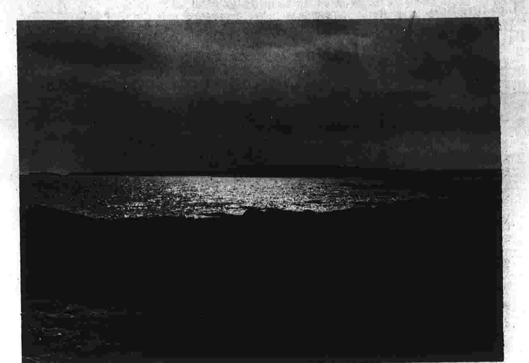
THE ROCKBOUND COAST

Whether this massive conversion is possible may be open to question, but it can be done, the chance of a McGovern victory will be highly enhanced. The old pros don't think the plan will work, but so far they have a perfect record in misconstruing the force of the McGovern campaign. They could be wrong again. — MIDDLETOWN PRESS.