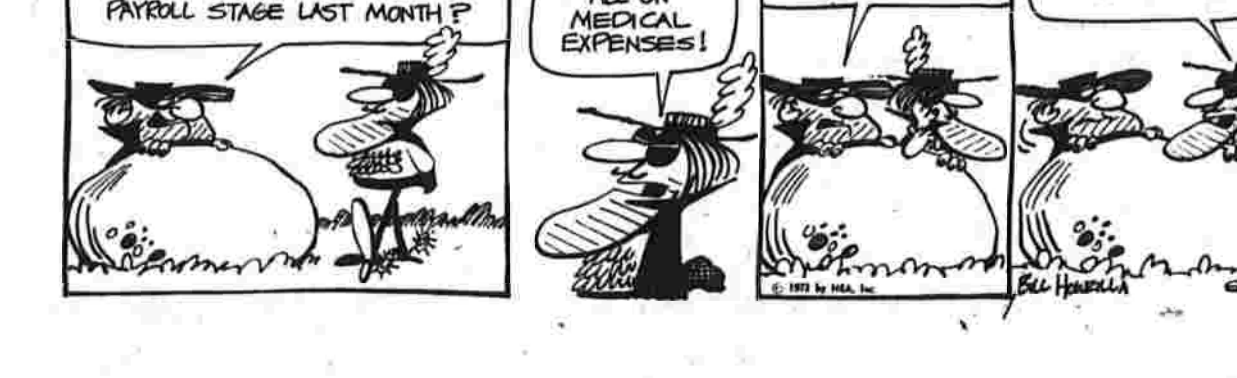
SGT. STRIPES... FOREVER