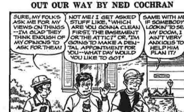
OUT OUR WAY BY NED COCHRAN