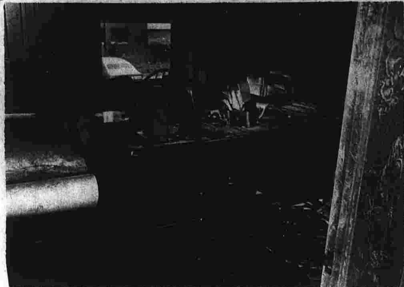
Air conditioner and other fire damaged equipment lie amid rubble on desk.